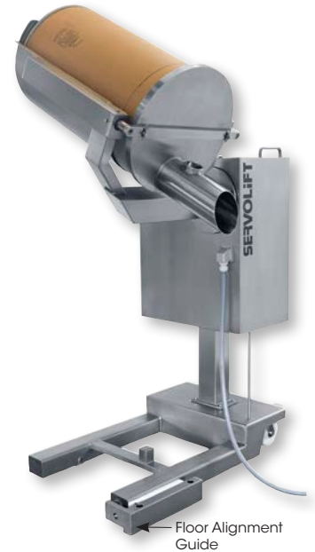
Tablet Coater Loading Machine "Lid Press Style"