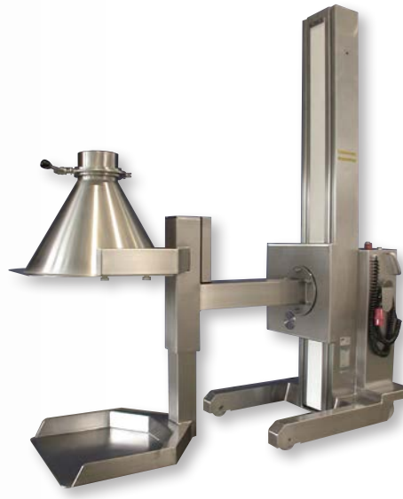
Tablet Coater Loading Machine "Funnel Clamping" Style