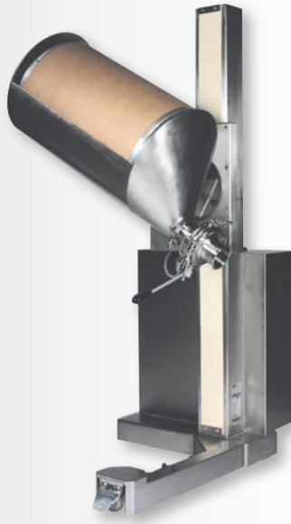
Tablet Coater Loading Machine "Chute" Style