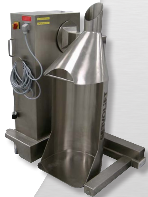
Tipper (loading to a tablet Coater)