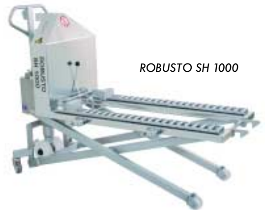
ROBUSTO SH 1000