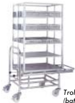
Trolley with roller conveyor (batch trolley)

The casks and models are fit for a practical, appropriate and safe handling of damageable ampoules and bottles. For the automated sterilizing process. Independent of product's shape or geometry, SCHNEIDER engineering develops the optimum product carrier and the perfect product acceptance, for the ideal sterilization process.