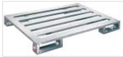
Aluminum flat pallet with short skids Pallet deck with 4 longitudinal planks and 4 short skids 300 mm long