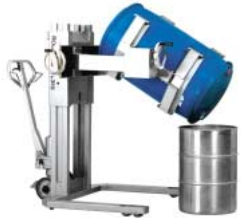
ROBUSTO FL 350 GBK