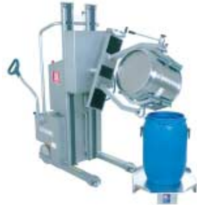
ROBUSTO FL 120 E D GBK