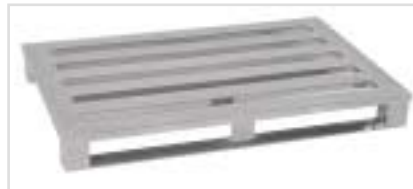
Aluminum pallet, the heavyweight type 512R Pallet deck with 4 longitudinal planks, heavy skid design