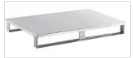
Aluminum full-deck pallet type 816 Pallet deck closed above and below, with longitudinal skids