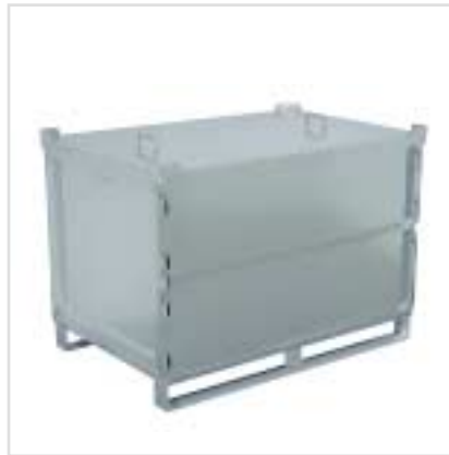
Container for use in pharmaceutical industry