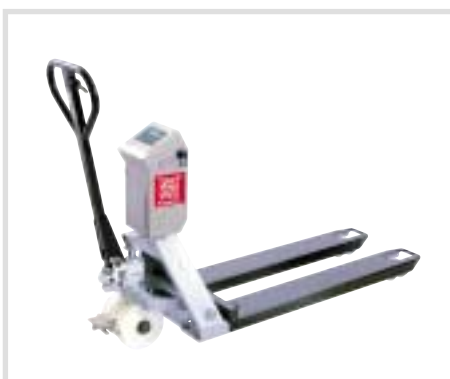
ROBUSTO Prima SL 1000 / VL 1000