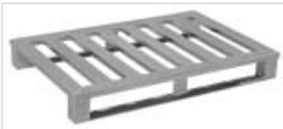
Aluminum pallet, the heavyweight type 512 Pallet deck with 6 cross planks, heavy skid design