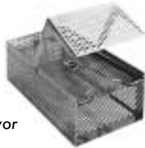
Ampoule cassette with flap