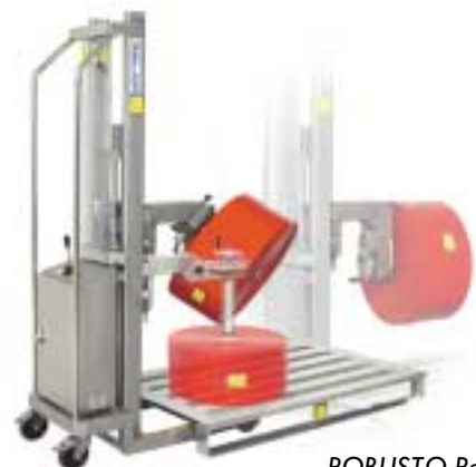
ROBUSTO Reflex 125 V