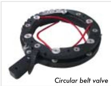
Circular belt valve

Easy dosing due to valve controlling with integrated emptying system, full cleanout by avoiding the formation of wrinkles.