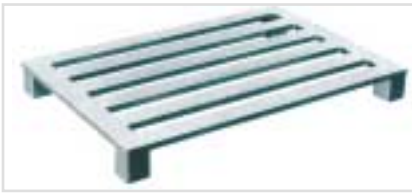
Aluminum 4-way pallet type 520 Pallet deck with 4 longitudinal planks and 4 corner feet

As innovative manufacturer SCHNEIDER LEICHTBAU offers a wide range of different pallets for any possible scope of application – naturally also with the AluClean® surface.