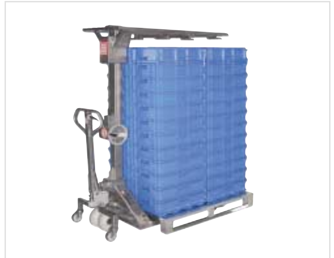
Special design fork-lift truck