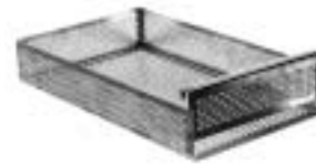
Ampoule cassette with slide