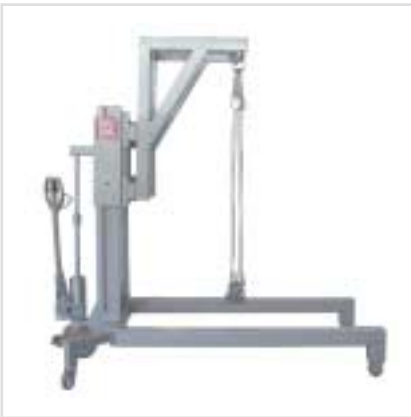
Mobile crane-like gripping arm