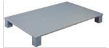
Aluminum full-deck pallet type 520 Pallet deck closed above and below, with 4 corner feet