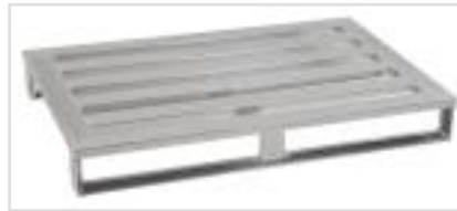
Aluminum flat pallet type 816R Pallet deck with 4 longitudinal planks, light skid design