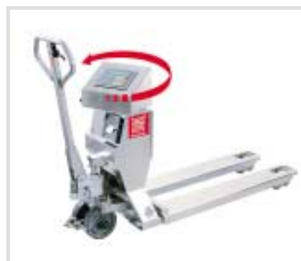
ROBUSTO SL 3000 / VL 3000