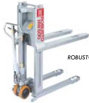
ROBUSTO HHW 600