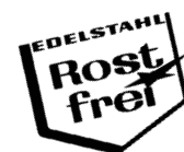
Stainless-steel flat pallet with corner feet Pallet deck with 7 cross planks and 4 corner feet