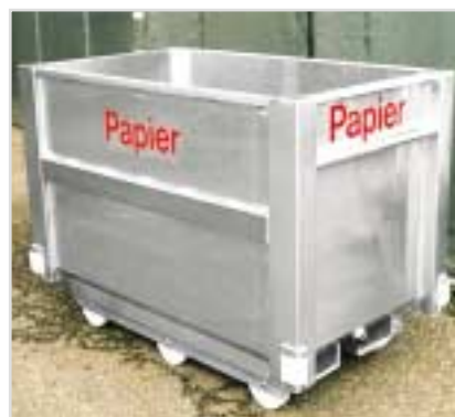
Container with fixed wheels