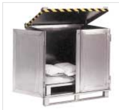
Small container I