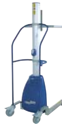
ROBUSTO Newton 250