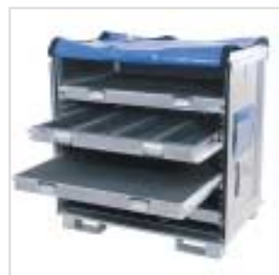
Container with tarpaulin GK 22