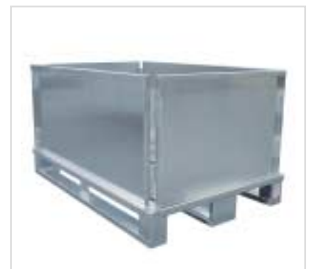
Foldable and stackable frame