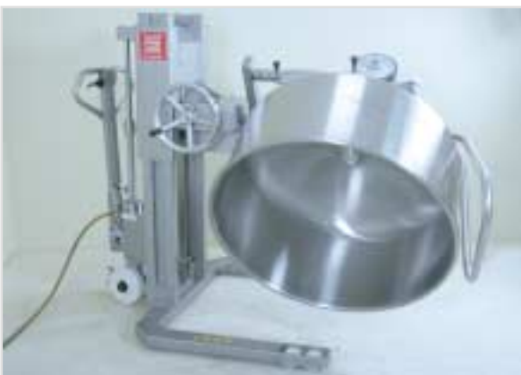
Special lifter, pneumatic with manual, lateral tilting device and 2 arbors