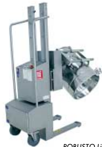
ROBUSTO Lifter FL 120