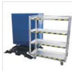
Mobile, variable transporting system