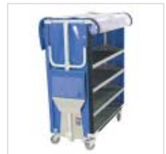
Multi-level wagon-conversion system