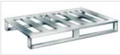
Aluminum flat pallet – the classic type 816 Pallet deck with 5 cross planks, light skid design