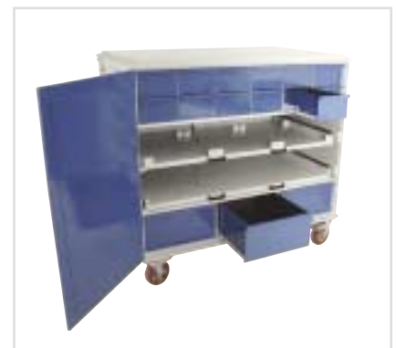
Tool & gear wagon