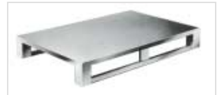
Aluminum full deck pallet, the super hygienic type 512 Pallet deck closed above and below, with longitudinal skids