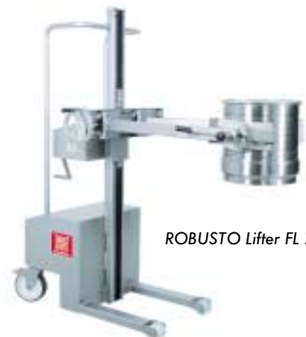
ROBUSTO Lifter FL 70 GBK