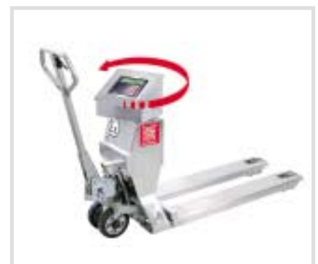
ROBUSTO SL 3000 Ex / VL 3000 Ex