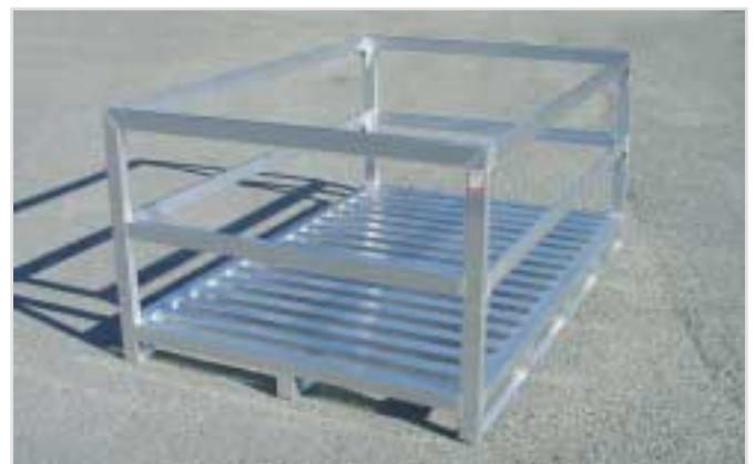
Aluminum box with skids