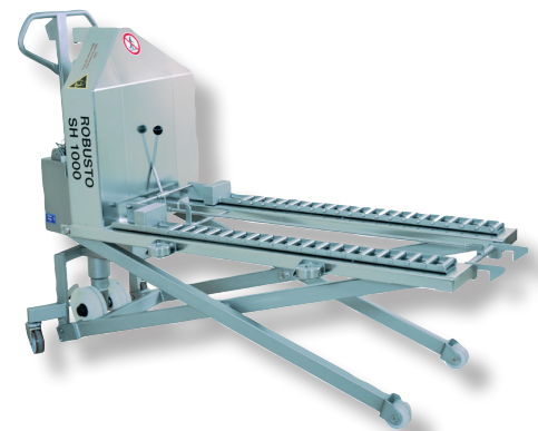
CAN BE SUPPLIED WITH ROLLERS FOR EASY LOADING