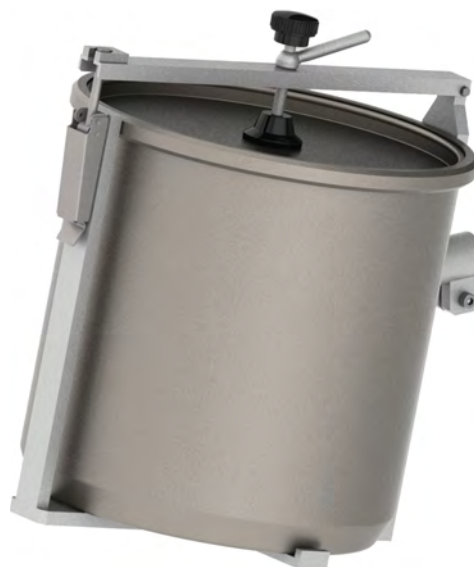
Closed BV type container holder

BV type container holders available as a standard for following container sizes: