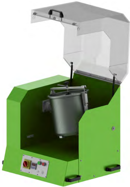
Single-side protection hood