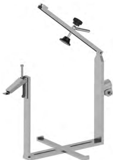
Open BV type container holder

Standard type BV container holders, welded and galvanised steel structure. Container placed on the holder base. Hose clamp simply swung down onto the holder and clamped with the quick-action clamping fastener. Adjustable stamp in the middle of the clamp to press onto the container cover and to fine adjust the container height. Customised container holders available.