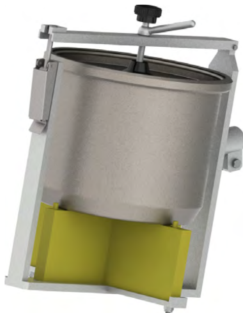
Adapter for BV type holder

This polypropylene adapter may be clamped onto the holder and allows the use of smaller containers (height and diameter).