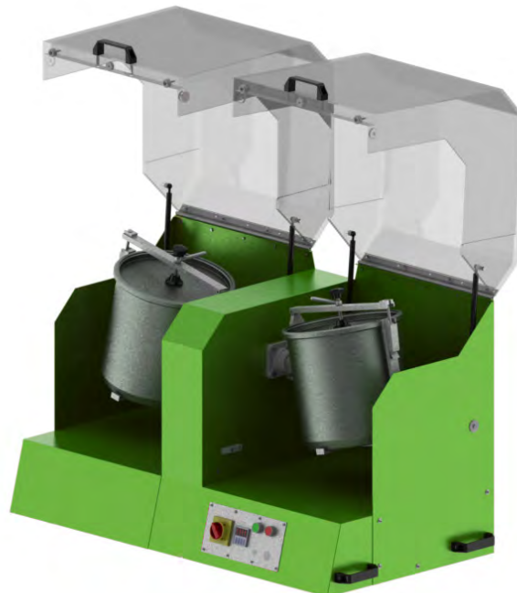
Two-sides protection hood